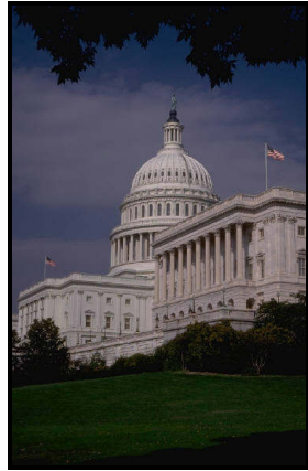
U. S Capitol